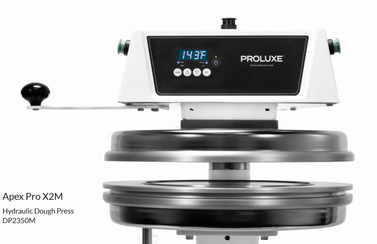
Apex Pro X2M Hydraulic Dough Press DP2350M

It's all new, and all powerful. Completely redesigned and packed with our most advanced hydraulic system, and interchangeable molds. It will make you rethink what a press is capable of.